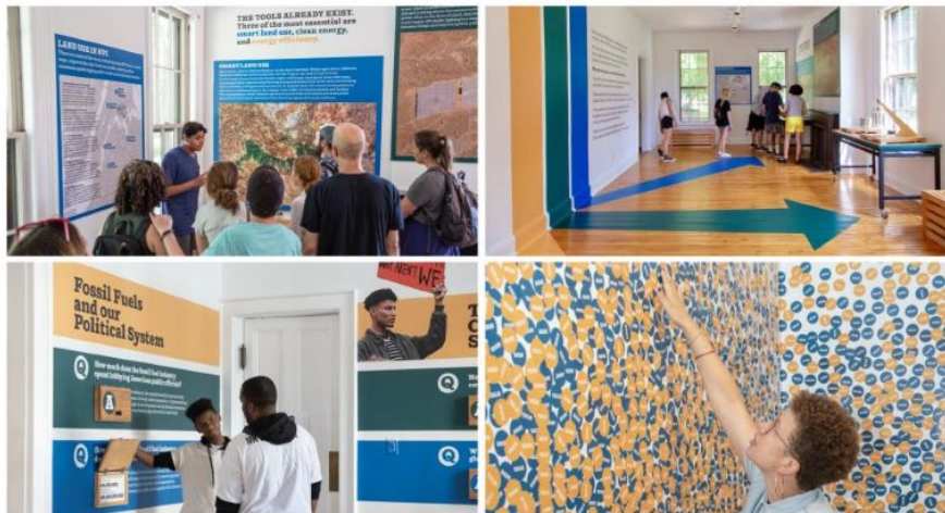
The Climate Museum’s 2019 exhibition, Taking Action, on Governors Island.