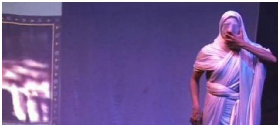
Video: The Thorn, the Leaf, and the Butterfly (excerpt) // password: thorn