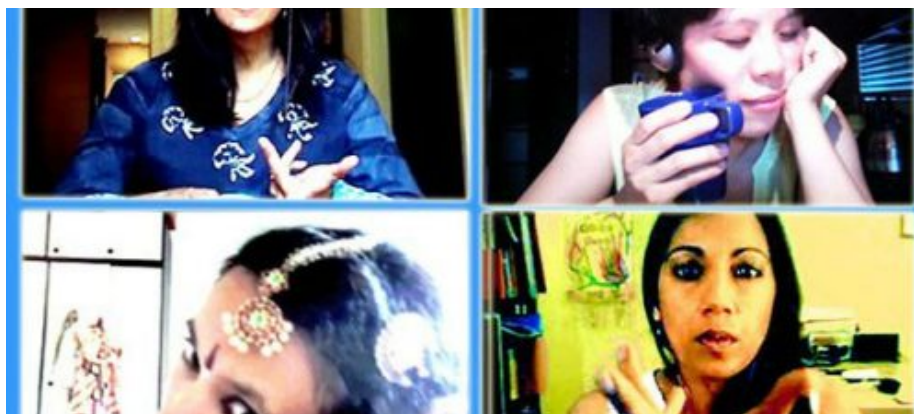
Video: Cyber Chat 1

Post Natyam Collective Members Reflect on Long-Distance Collaboration