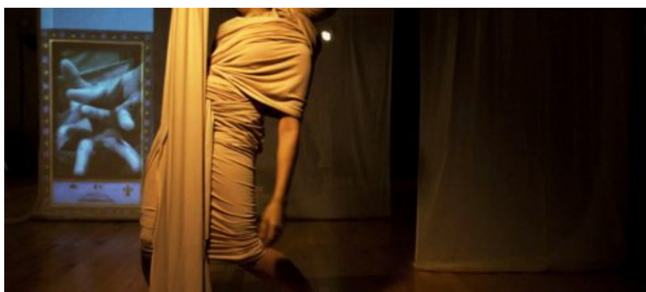
Sunoh! Tell Me, Sister