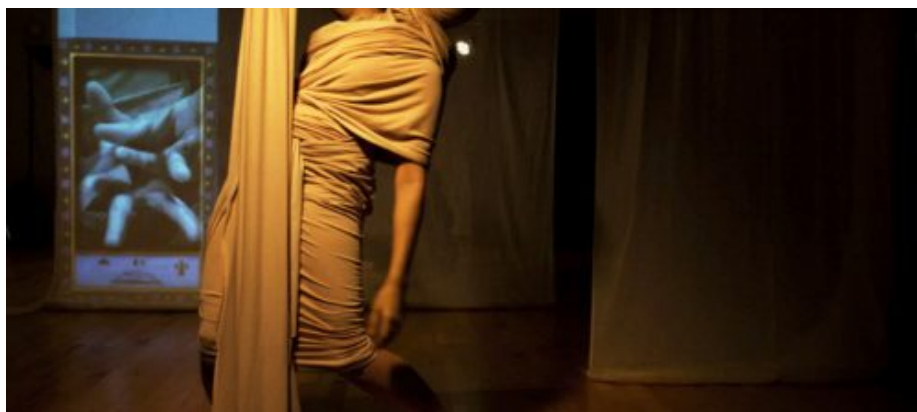
Sunoh! Tell Me, Sister