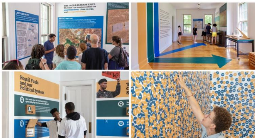
The Climate Museum’s 2019 exhibition, Taking Action, on Governors Island.