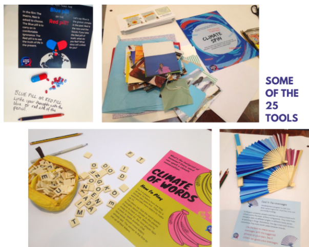
SOME OF THE 25 TOOLS

What was the point of departure to establish the museum? Was there an initial idea or spark?